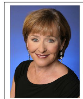
Frederica von Stade

Washington Performing Arts Society's 2008/2009-season continues in the New Year to provide a broad range of internationally-celebrated artists, orchestras and ensembles and the finest emerging talent from around the world, while also providing area children, adults and seniors with enlightening educational programming.